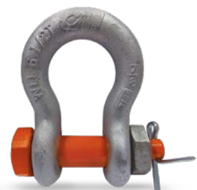
Bolt, Nut & Cotter