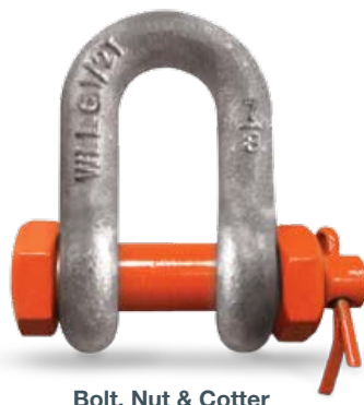
Bolt, Nut & Cotter