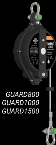
GUARD800 GUARD1000 GUARD1500