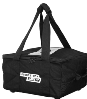
Holdall bag GSE-H/ALL