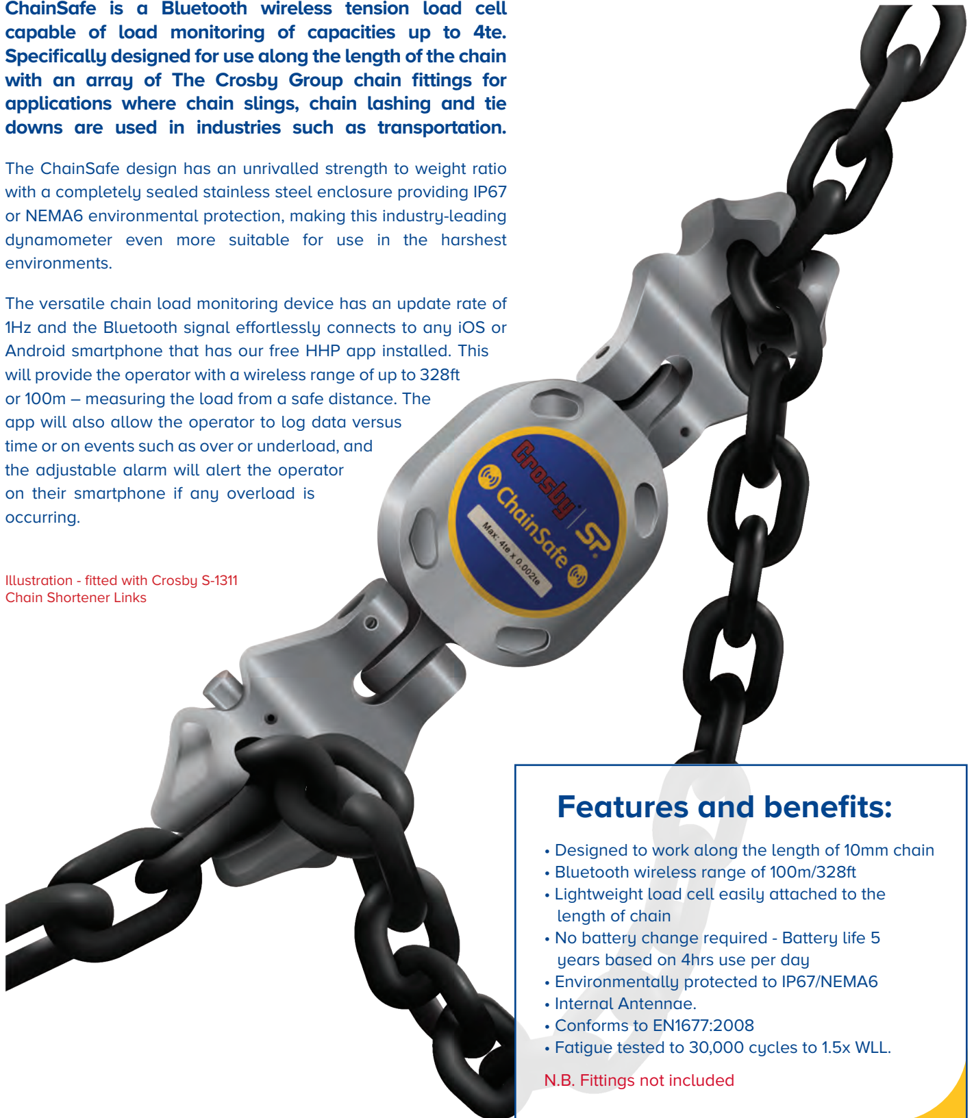
Illustration - fitted with Crosby S-1311 Chain Shortener Links

The versatile chain load monitoring device has an update rate of 1Hz and the Bluetooth signal effortlessly connects to any iOS or Android smartphone that has our free HHP app installed. This will provide the operator with a wireless range of up to 328ft or 100m – measuring the load from a safe distance. The app will also allow the operator to log data versus time or on events such as over or underload, and the adjustable alarm will alert the operator on their smartphone if any overload is occurring.